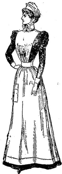
The "Rena" Apron. Made of linen finished Cloth lock-stitch throughout, 2/6 each. In two sizes, 36 in. & 39 in. from waist to hem.