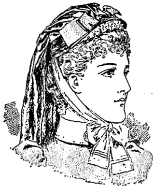
The "St. Bride's" Bonnet. Made of fine Straw with Lace and ruching, and trimmed with Ribbon, and long Silk Gossamer Fall. In black and colours, 12/6 each. Without Fall, 9/6; also The "St. Clare" Bonnet. 6/11 complete.