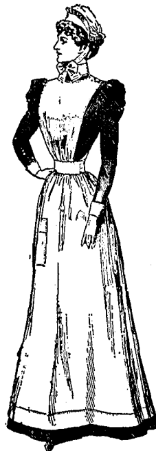
The "Rena" Apron. Made of linen finished Cloth lock-stitch throughout, 2/6 each. In two sizes, 36 in. & 39 in. from waist to hem.