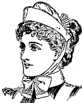
The New "Sister Dora" Cap. Made of washing Cambric, with draw strings. Can be washed as easily as a handkerchief. 1/-. Without strings, 10½d.