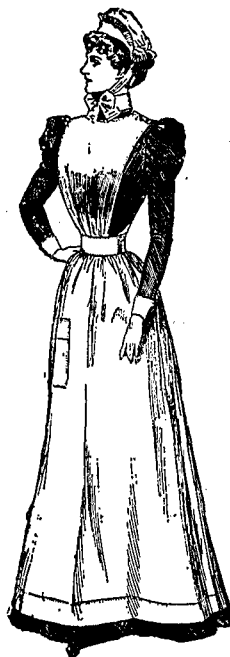
The "Rena" Apron. Made of linen finished Cloth lock-stitch throughout, 2/6 each. In two sizes, 36 in. & 39 in. from waist to hem.

PATTERNS FREE OF THE New Washing Materials for Nurses' Dresses, INCLUDING REGATTA CLOTHS, HECTOR DRILLS, HALIFAX CLOTH, ATTALEA TWILLS, &c.