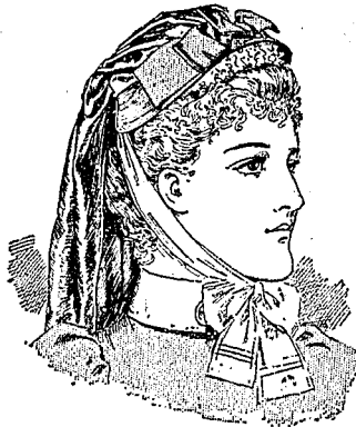
The "St. Bride's" Bonnet. Made of fine Straw with Lace and ruching, and trimmed with Ribbon, and long Silk Gossamer Fall. In black and colours, 12/6 each. Without Fall, 9/6; also