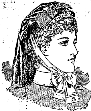
The "St. Bride's" Bonnet. Made of fine Straw with Lace and ruching, and trimmed with Ribbon, and long Silk Gossamer Fall. In black and colours, 12/6 each. Without Fall, 9/6; also The "St. Clare" Bonnet. 6/11 complete.