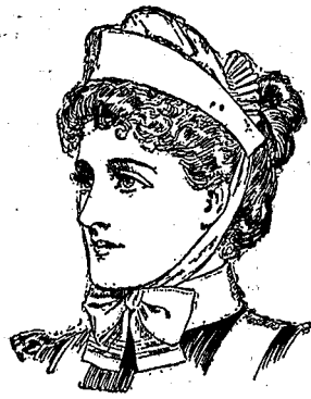
The New "Sister Dora" Cap. Made of washing Cambric, with draw strings. Can be washed as easily as a handkerchief. 1/-. Without strings, 10½d.