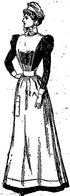
The "Rena" Apron. Made of linen finished Cloth lock-stitch throughout, 2/6 each. In two sizes, 36 in. & 39 in. from waist to hem.

PATTERNS FREE OF THE New Washing Materials for Nurses' Dresses, INCLUDING REGATTA CLOTHS, HECTOR DRILLS, HALIFAX CLOTH, ATTALEA TWILLS, &c.