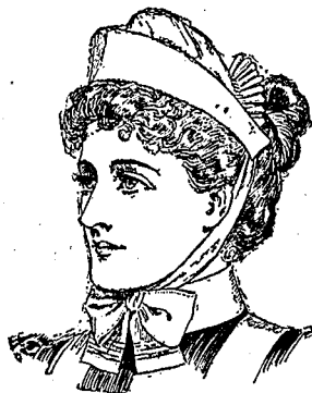
The New "Sister Dora" Cap. Made of washing Cambric, with draw strings. Can be washed as easily as a handkerchief. 1/-. Without strings, 10½d.