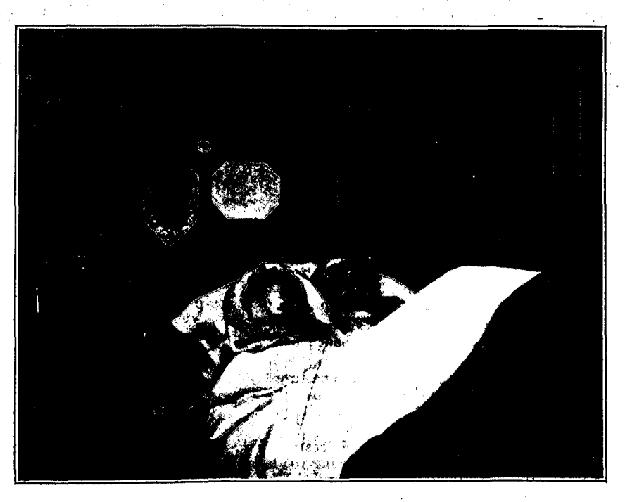
The Opposite Ends or Life.

of everybody who was considered well enough to go. At six they started, bandaged and bundled, a merry crew. Bob, being considered too young, was comforted by cook, who asked him to tea in her kitchen, and gave him a ruddy-cheeked apple, clutching which, he watched them depart, safe in her strong arms. "I," he said, pompously, to anyone who would listen, "is gwine out alone in a gee-gee with Sister." Sure enough one day, not long after, a wildly excited little boy was taken out by Sister in a dog-cart. Meanwhile the carnival party enjoyed itself thoroughly. Five times round the town did they go; occasionally, owing to the pressure of the crowd, a stoppage had to be made, and their