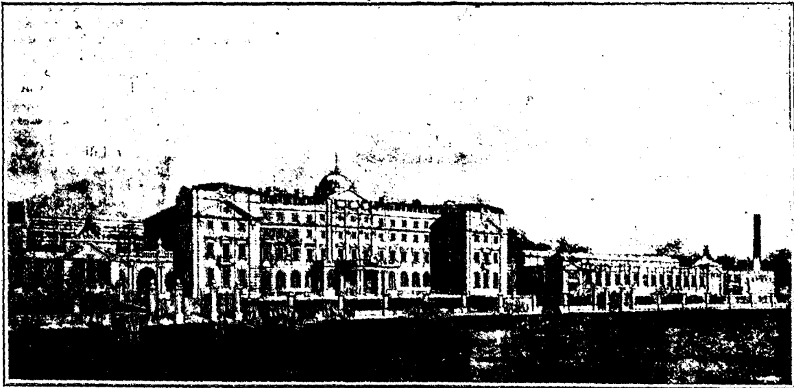
THE ACCEPTED DESIGN FOR THE NEW KING'S COLLEGE HOSPITAL, CAMBERWELL, S.E.

A "Field Officer" writes in the Broad Arrow that "Unless some better regulations are invented by the Royal Army Medical Corps, their new Guard's Hospital in Burlington Street, Grosvenor Road, West-