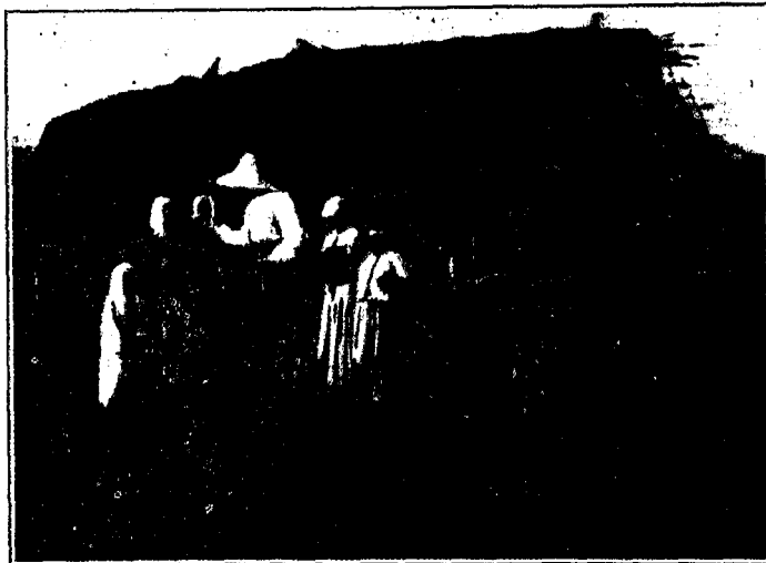
A FRENCHWOMAN ADMINISTERING QUININE TO NATIVES.

2. There are clinical institutions for women and