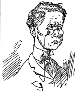
Our Book Reviewer.

"CRUSHES AND CROWDS in Theatres, and other Buildings, in cases of Fire or Fright.—