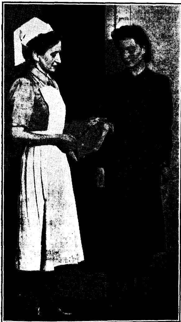
S.R.N. Washing Dress with Cap and Apron.

Costumes are made in men's navy suiting serge, single-